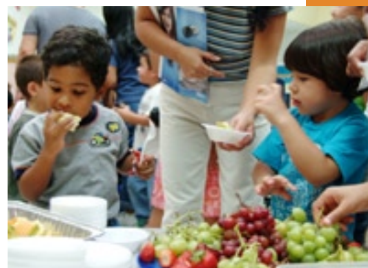
Children select healthy foods at a recent Salsa, Sabor Y Salud session in Miami.

Community-based children's groups in Chicago, New York, Denver; Los Angeles, Phoenix, Miami, Houston, San Antonio, and many other cities have used an NLCI-developed training kit to implement the curriculum.